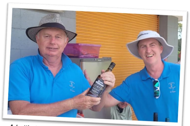
A bottle to celebrate the win and to drown the sorrows