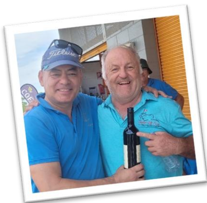
Prize winners are grinners!